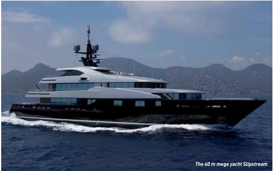
The 60 m mega yacht Slipstream